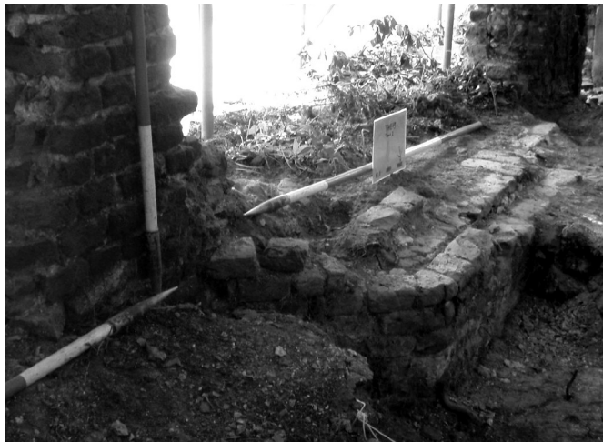
Fig. 2: The Projecting Bay

A survey of the boundary wall revealed several features and areas of rebuilding (SWA (Standing Wall Areas) 1 – 7 on Fig. 1) that suggest that in the process, and perhaps later when the area was part of a private nineteenth century school, quite a lot of modification had taken place. They included niches built into the wall and later blocked (Fig. 1 SWA 2 and 6), but in particular three windows/doors close together (SWA 3 – 5) which clearly had complex histories.