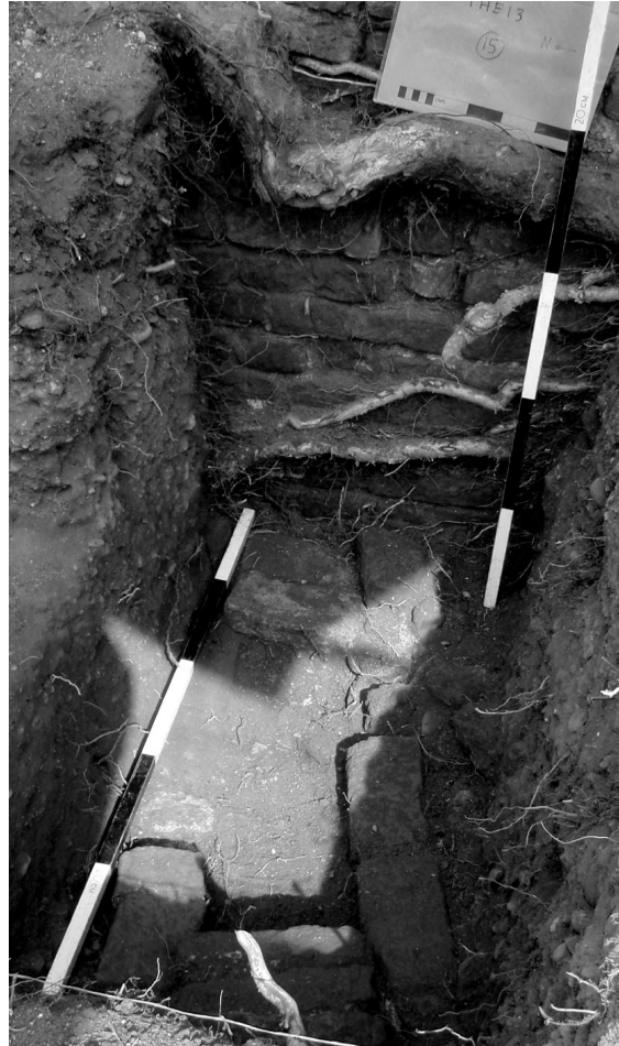
Fig. 3: The Drain (Foreground) with Blocking Brick Across its Line and Cut Through by the Privy Garden Boundary Wall

This wall is known to have been here by 1611, even if a door in it had subsequently been blocked (Fig. 1 SWA 7), so the water supply channels probably belong to the Tudor water gardens of